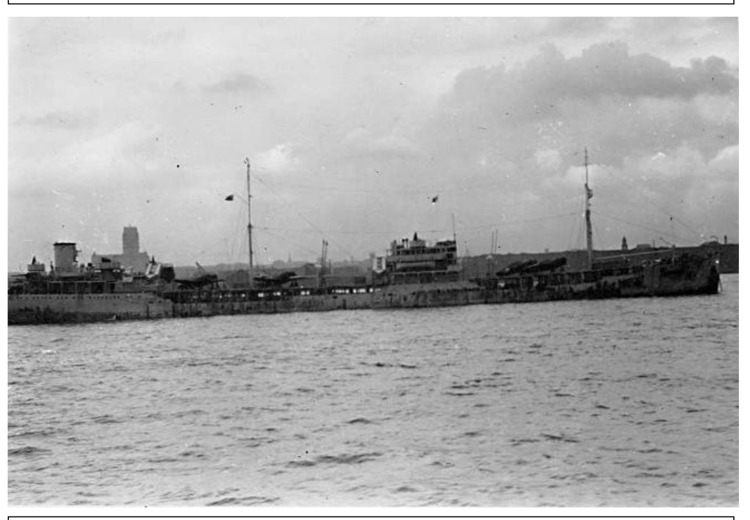
Image 3 is a postcard image showing Dolabella. Date and time not known

Image 2 shows Dolabella in the Mersey with aeroplanes destined for Russian loaded on her false deck.