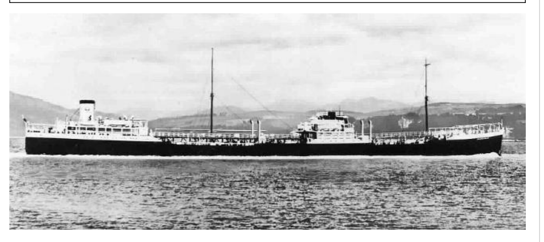
Image 1 is from an old postcard of Dolabella - the date is not known.

Dolabella was launched in 1939 and immediately put into service on WW2 convoys. Her war service was exceptional and she remained with the same company throughout her service life of 19 years until broken up in 1958. There is further information about some of her voyages on the Recollections section of the Benjidog website HERE.